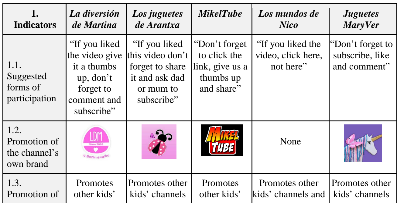
Table 1. Indicators to promote and encourage viewers’ participation.